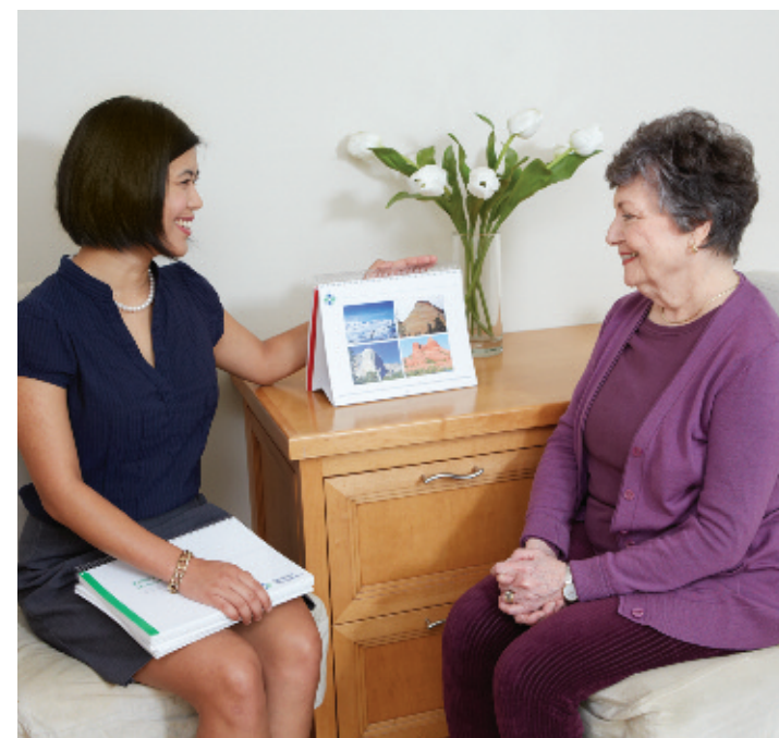
Introducing the Cognitive Therapeutics Montessori Approach